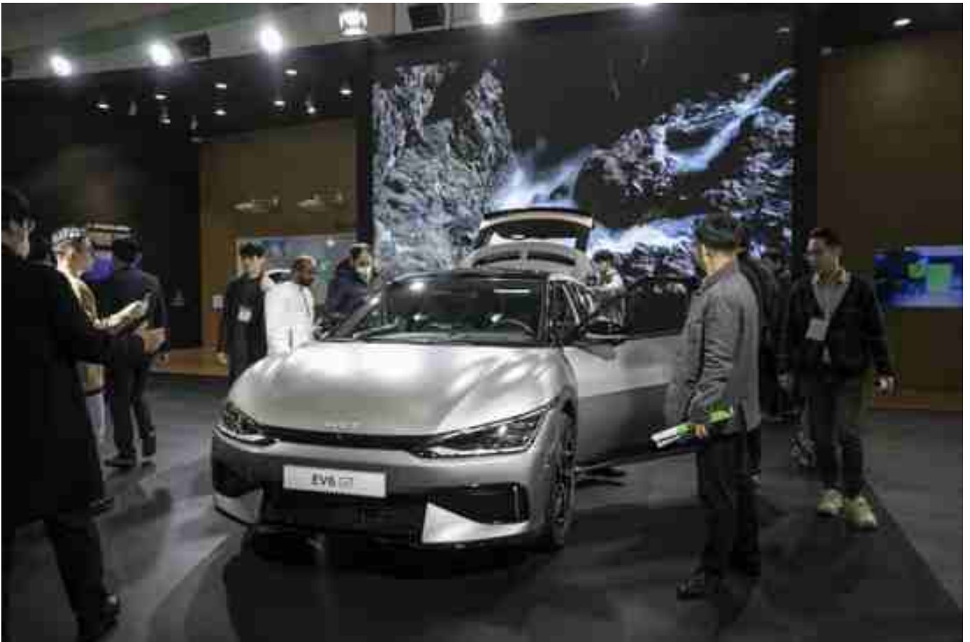
A Kia EV6 GT electric vehicle at an exhibition in Seoul last year.

Automakers have grown more cautious about EV launches amid modest demand. Sales of fully electric models in the U.S. rose 6.8% through the first half of the year, according to Motor Intelligence data, a sharp deceleration from near 50% growth in 2023.